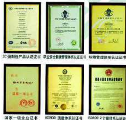
3C 强制性产品认证证书 职业健康安全管理体系认证证书 环境管理体系认证证书

地址: 中国江苏徐州市铜山路165号 Add: No.165 Tongshan Road Xuzhou Jiangsu China 电话(Tel): 0516-83462242 83462350 传真(Fax): 0516-83461669 邮编(Post Code): 221004 网址(URL): http://www.xzxc.com.cn E-mail: xzxcyx@pub.xz.jsinfo.net 服务电话(Service Tel): 0516-83461183 服务传真(Service Fax): 0516-83461180 质量监督电话 (Quality Inquiry Tel): 0516-87888268 备件电话(Spare Parts Tel): 0516-83461542 大修厂(Overhaul Factory): 0516-83461904